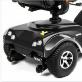
1.600 Watt motor