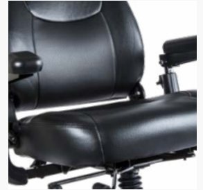
Spring-loaded comfort seating system