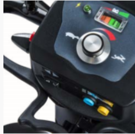
Simple user guidance