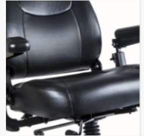
Spring-loaded comfort seating system