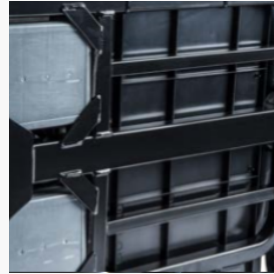
Extremely robust cassette-type frame