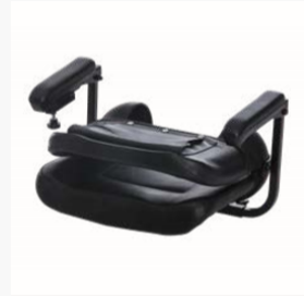
Dismantles into three parts