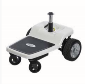
500 mm turning radius