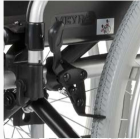
Knee lever brake