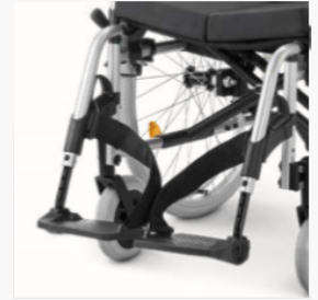
Angle adjustable footplates