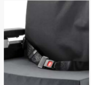
Reinforced seat belt