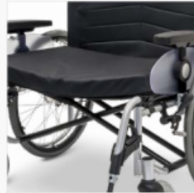
Increased stability through the use of a double shear