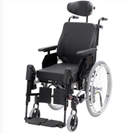
Netti 4U CE Plus