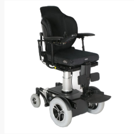
TA IQ FWD