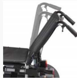
30° back adjustment can be selected as option