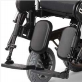
Electrically adjustable legrest available as an option