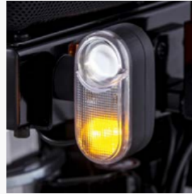
Active LED lighting