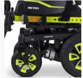
Castor wheels with aluminium rim